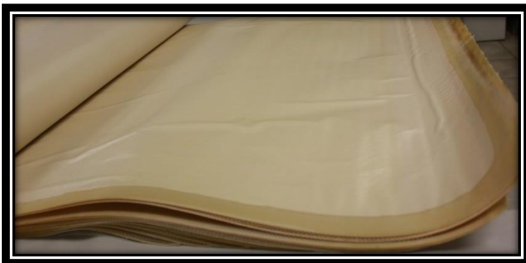
Membrane was fouled with a thin layer of scale

The first stage lead element was fouled with biological matter and suspended solids. The last stage tail element was fouled with phosphate scale, polymerized silica, suspended solids, and biofilm. Delamination had caused an irreversible 3% loss in salt rejection.